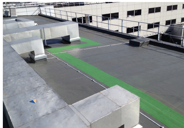
International Departure Lounge, Heathrow Airport, UK

Before applying Sealoflex Prima make sure the substrate has been properly prepared and primed.